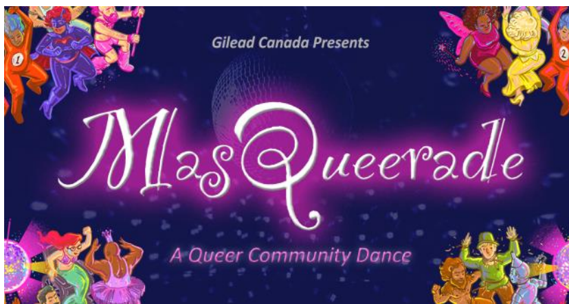
A shout out to our Presenting Sponsor: Gilead Canada , and our Gold Sponsor: ViiV Healthcare .

If you are interested in lending us a hand on any of these days, send us an email at walk@acns.ns.ca .